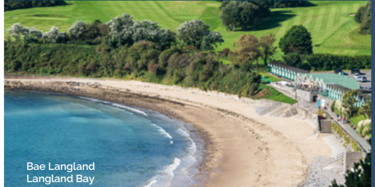
Bae Langland Langland Bay

★ Traeth Aberafan Mae dwy filltir o bromenâd gwastad ar lan y môr, ynghyd â thraeth tywodlyd eang a golygfeydd gwych dros Fae Abertawe tua Phenrhyn Gŵyr. Mae Traeth Aberafan yn lle delfrydol i wylïo'r haul yn machlud.