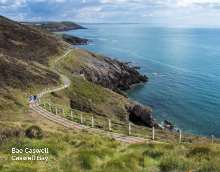
Bae Caswell Caswell Bay