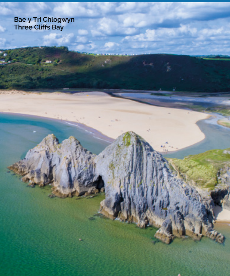
Bae y Tri Chlogwyn Three Cliffs Bay

Gallwch ail-lenwi eich potel ddŵr yn ystod eich taith. Lawrlwythwch ap Refill i ddod o hyd i'ch Gorsaf Ail-lenwi leol, gan gael dŵr yfed ffres yn ystod eich taith. refill.org.uk