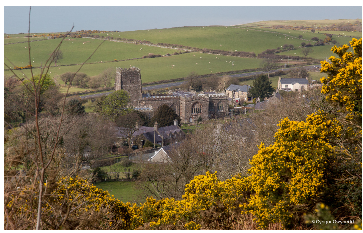
St Beuno's church looking towards the coast